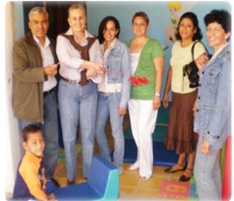
Teleton and Special Needs School