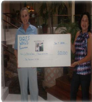
Eagle's Wings Foundation