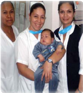
Amerimed San Lucas